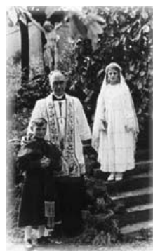
Children hiding under a different religion