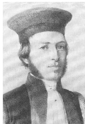
SAMUEL NAUMBOURG (1815-1880)

The Torah service for Saturday morning will feature the music of Samuel Naumbourg. Along with Louis Lewandowski and Solomon Sulzer, Naumbourg transformed