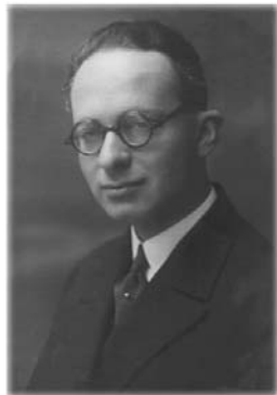
MARIO CASTELNUOVO- TEDESCO (1895-1968)

In 1938, Castelnuovo-Tedesco wrote to Arturo Toscanini, the former music director of La Scala, explaining his need to escape from the rising tide of anti-Semitism in Italy. Consequently, Toscanini sponsored Castelnuovo-Tedesco as an immigrant to the United States. Like many artists who fled fascism, Castelnuovo-Tedesco ended up in Hollywood, where—with the help of Heifetz—he obtained a contract with MGM as a film composer. Castelnuovo-Tedesco