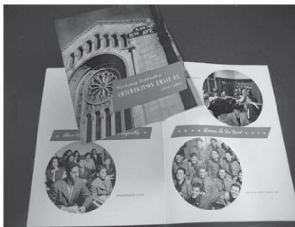
Bottom photo: Temple Emanu-El's Centenary Celebration booklet features Temple history as well as photos from various Temple groups, including the Women's Auxiliary, the Confirmation class and the Emanu-El Scout Troop.