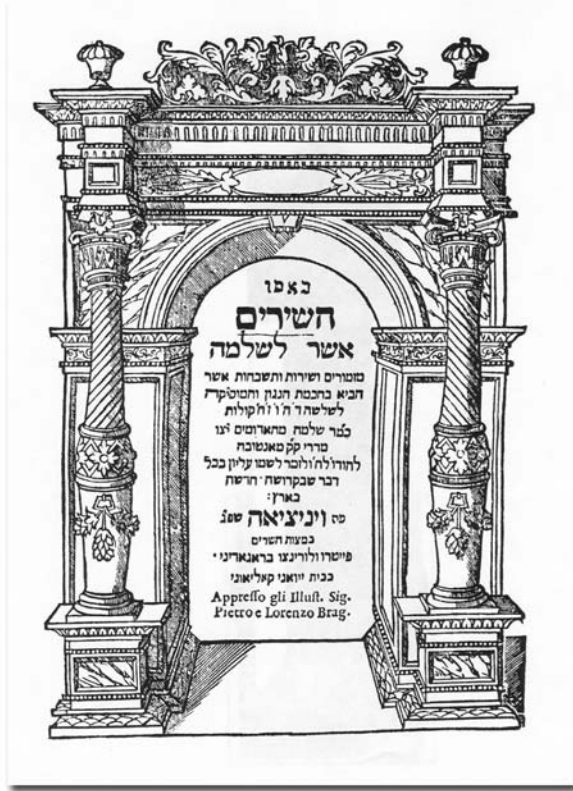
The cover of Salamone Rossi's 1622 publication The Songs According to Solomon (HaShirim Asher LiShlomo) , a play on the opening line of the biblical Song of Songs (Shir HaShirim).

Like that of his contemporary, the famous Christian composer Claudio Monteverdi, Rossi's secular and liturgical music bridged the end of the Renaissance and the beginning of the Baroque eras in Italy. In the Jewish world, by publishing his HaShirim Asher LiShlomo , Rossi performed one of the most progressive acts in the entire history of Jewish music. His synagogue pieces were the first to use Western compositional techniques in the setting of Hebrew liturgical texts. Written for combinations of three to eight unaccompanied voices, the 33 pieces in HaShirim were the