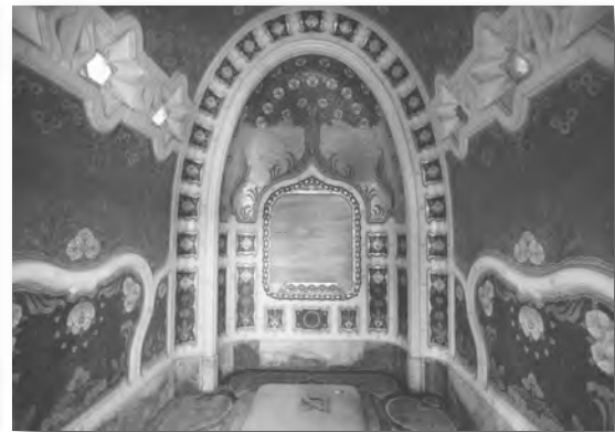
Image: Budapest, Kozma utca cemetery, Hungary. Interior of the Schmidl family vault, designed by Béla Lajta in 1904.

This exhibit is free and open to the public. Museum hours are from 10 A.M. to 4:30 P.M., Sunday through Thursday. Enter at One East 65th Street.