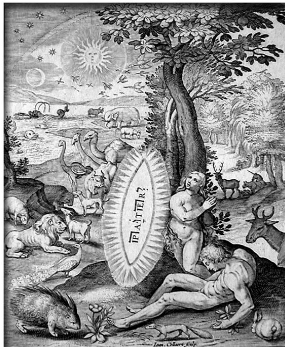
God Creating Eve — Engraving by Claes Janz Visscher, after a painting by Marten de Vos (Amsterdam, circa 1600)

ancient text (Mishnah Sanhedrin 4:7) we are taught of the precious humanity even of one accused of murder. As those testifying against him are reminded—based on the idea that the first human being was created in God's image—every human life is sacred, unique and of infinite value.